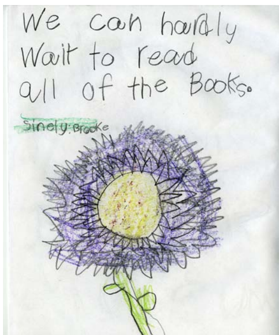
From students at Port Orange Elementary School in Port Orange, Florida