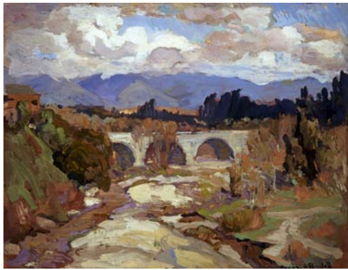
top: Franz Bischoff (1864-1929), Arroyo Seco Bridge , 1912, oil on canvas, 30 x 40 in., The Irvine Museum