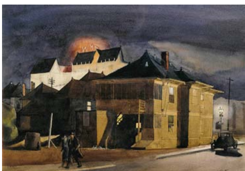
Millard Sheets (1907-1989), Beneath the Glow , watercolor, 15 x 21 inches, The Hilbert Collection